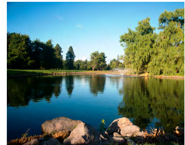
This golf course pond was cleaned up with Aquafix biocatalysts and probiotics.