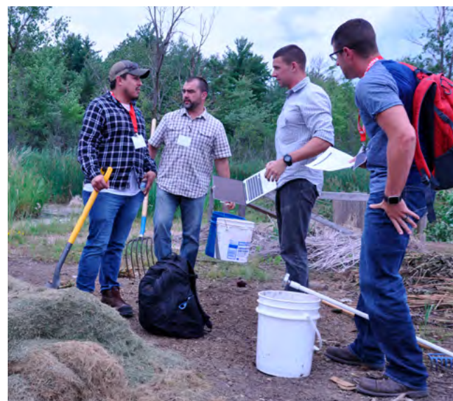
Students in the 2017 Midwest Compost School build compost piles during a hands-on exercise in the course.