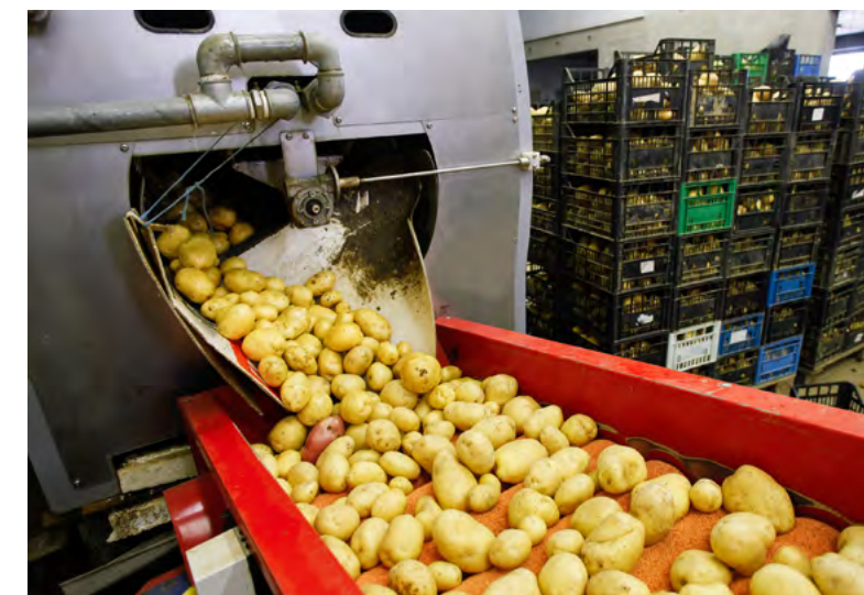
Potato peels and other residuals from potato processing contain chemicals such as chlorogenic acid that are used in health supplements and other natural products.

Naturally occurring products — so-called green chemicals — extracted from vegetable residual material could complement the synthetic chemical market.