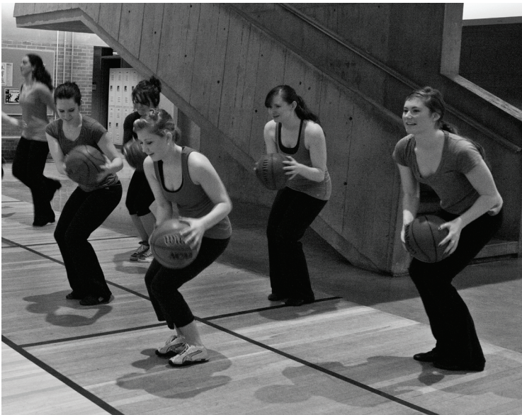
Dancers demonstrate Base Four Fibonacci patterns