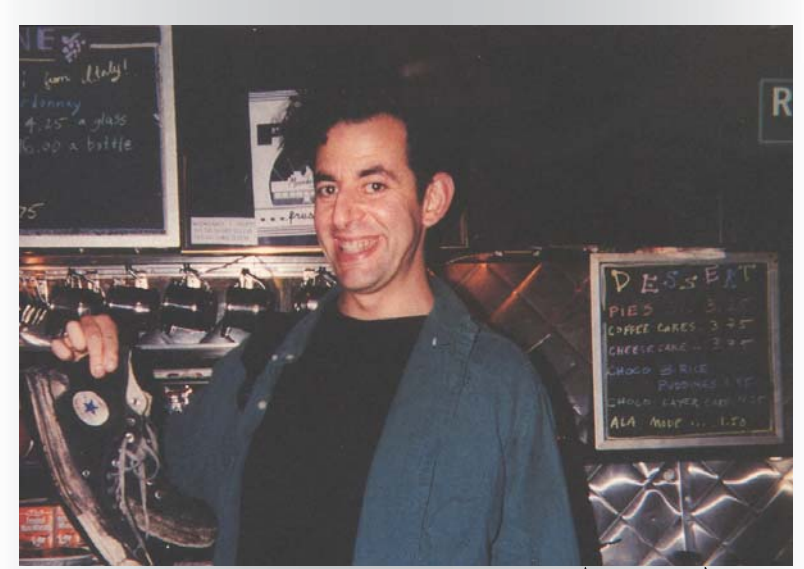
Last night of work at the Moondance Diner