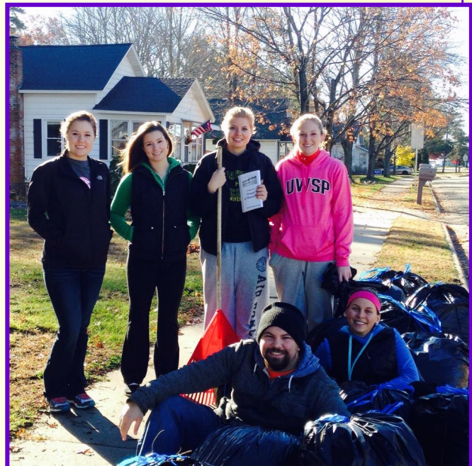
The club raked leaves for the elderly on Make a Difference Day