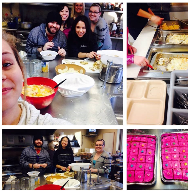
SSWO made and served dinners for the residents of the Salvation Army throughout the year