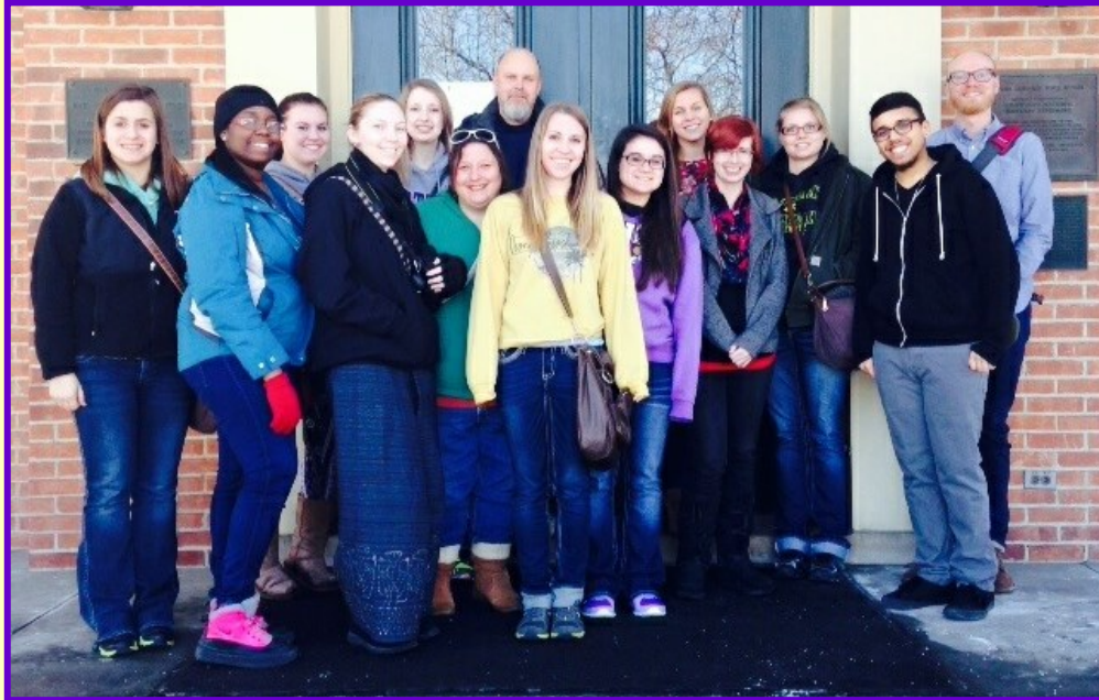
SSWO made a trip to the Jane Addams Hull-House to learn about the history of Social Work