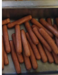
SSWO meets at the Hope Center every semester to make and serve a meal for the residents at the homeless shelter.