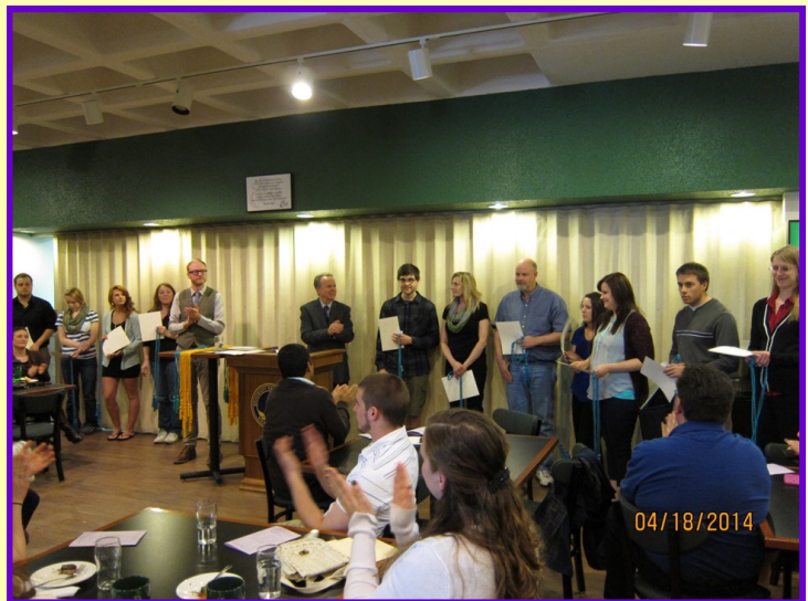
Alpha Kappa Delta Initiates