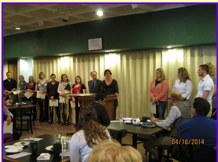
Phi Alpha Initiates