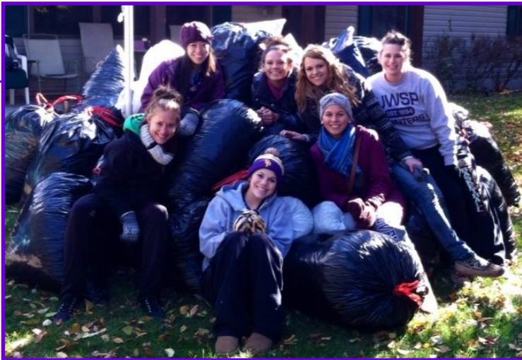
Make a Difference Day: SSWO members raked leaves for the elderly in the community.

The Sociology and Social Work Organization (SSWO) was involved in many volunteer and fundraising opportunities this past year. The group helped prepare and serve meals at the Salvation Army for the guests at the shelter, and also rang bells to raise money for the Salvation Army. They had a significant turnout for Make A Difference Day and members helped rake yards for the elderly in the surrounding community. They also helped fundraise for Relay for Life throughout the year, raising nearly $2,000 through personal fundraising in addition to the SSWO cupcake bake sale. The organization has recently elected new officers, which are stated on SSWO brochure.