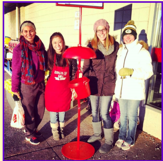
SSWO helped raise money for the Salvation Army by bell-ringing throughout the fall.