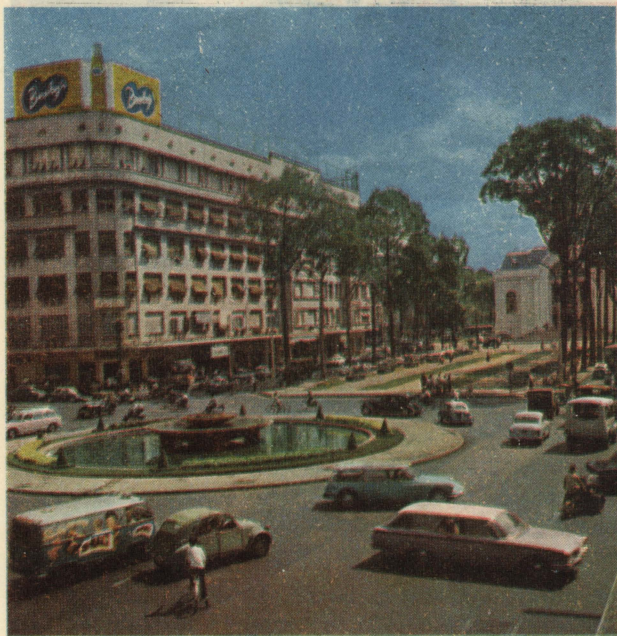
A shopping area in Saigon.

Viet-Nam handicraft articles, especially souvenirs such as tortoise shell, ivory goods, pottery, windscreens, conical hats, are available at the Handicraft Development Center, 86, Tu-Do street.