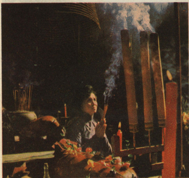
The cult of ancestors.

A visit to this site will give you a look into the Vietnamese traditional worship, the cult of ancestors. You can find relics of the National Hero in the main hall. The façade of the Temple ornamented, with bits of broken glass and porcelain fragments, is quite photogenic.