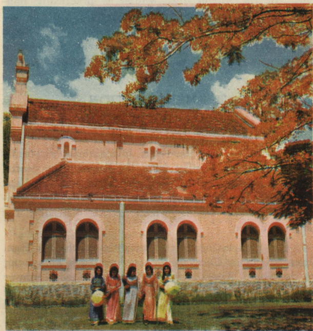
School girls with national costumes.

Duong Tu-Do, or Liberty Street, is Saigon's main street on which are found fashionable shops as well as several important Government buildings.