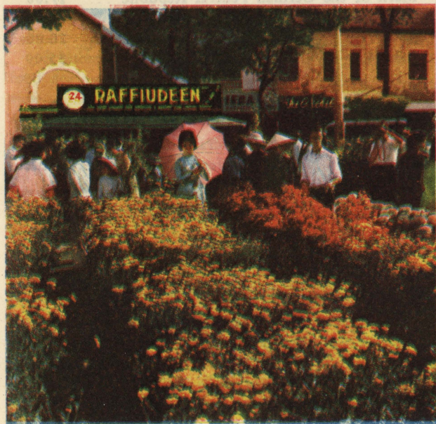
Flower Market along Nguyen-Hue Blvd. during the Vietnamese New Year.

In Saigon, flowers are fairly inexpensive and the variety is limited because most of them are brought in from Dalat, 6 hours away by car.