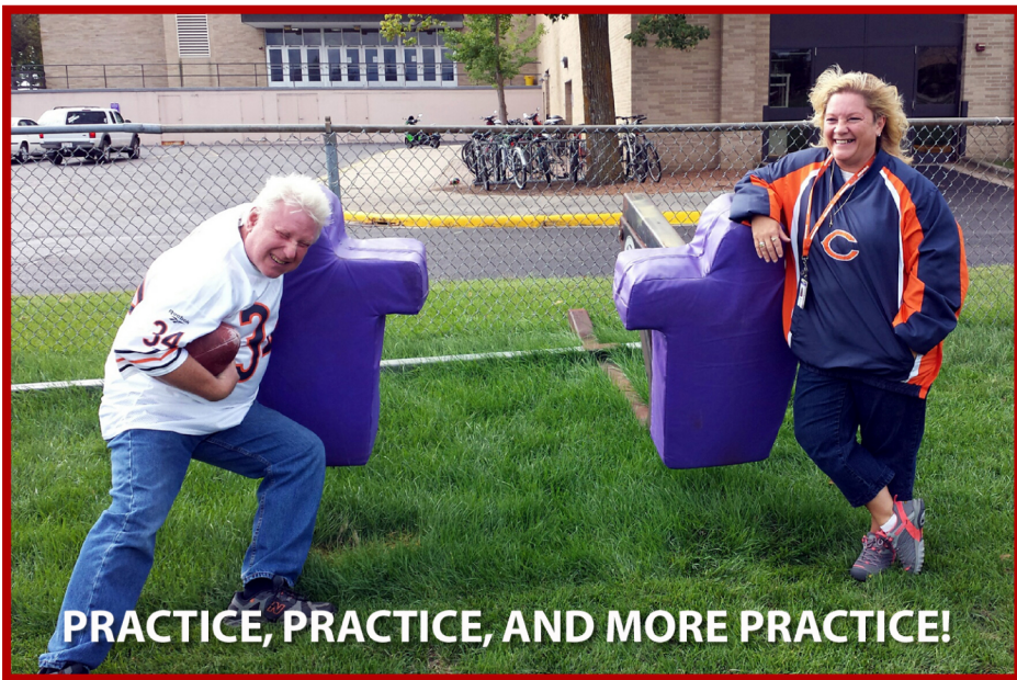
PRACTICE, PRACTICE, AND MORE PRACTICE!