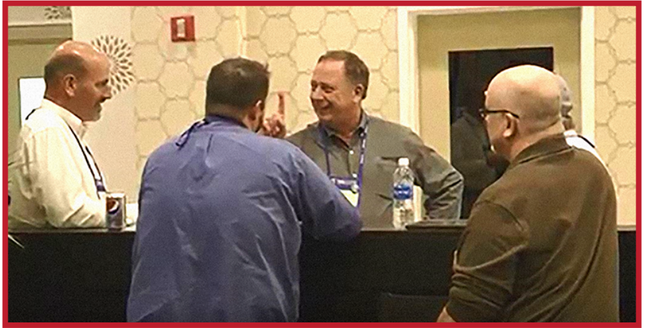
Participants in the recent WebTMA Conference exchanging ideas.