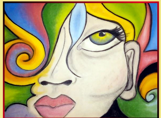
All of the above images