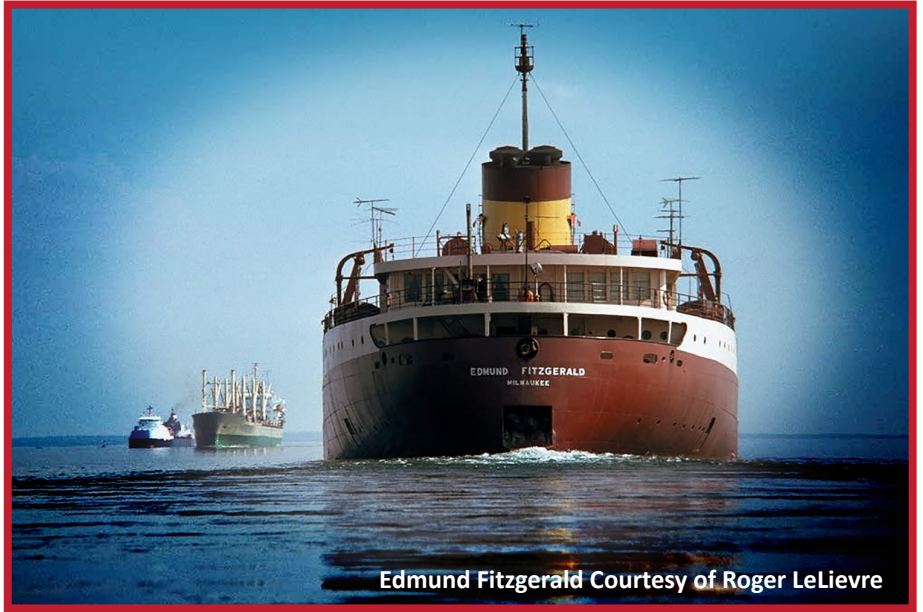
Edmund Fitzgerald

The legend of the Edmund Fitzgerald remains the most mysterious and controversial of all shipwreck tales heard around the Great Lakes. Her story is surpassed in books, film and media only by that of the Titanic. Canadian folksinger Gordon Lightfoot inspired popular interest in this vessel with his 1976 ballad, "The Wreck of the Edmund Fitzgerald."