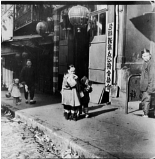
Returning home, Chinatown, San Francisco, between 1896 and 1906