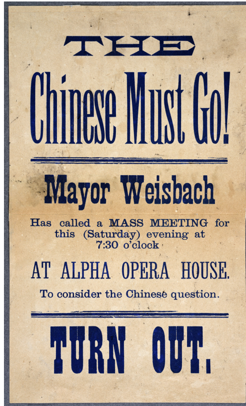
Poster calling for the expulsion of Chinese residents in Tacoma, 1885.

Some poems and some lessons contain disturbing material which may be triggering, including discussions of violent, racist acts. These lessons have been designed to support students in their understanding of these issues and to help them develop critical thinking and their own exploration of personal, local, and national histories.