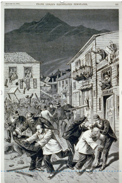
Colorado: the anti-Chinese riot in Denver, on October 31st [Chinese being beaten and property destroyed by large mob]; Wood engraving after sketch by N.B. Wilkins; Illus. in: Frank Leslie's illustrated newspaper, vol. 51 (1880 Nov. 20), p. 189.

Local and state officials tried to impose additional restrictions, such as the 1891 California law that prevented "the coming of Chinese persons into the State, whether subjects of the Chinese Empire or otherwise". This law was eventually declared unconstitutional in Ex Parte: Ah Cue , 1894. The Chinese Exclusion Act of 1882 and subsequent immigration laws were repealed with the passage of the Magnuson Act in 1943.