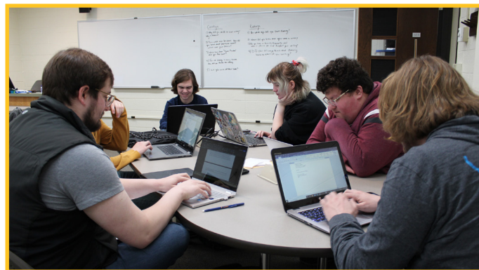
Students work together in their weekly Book and Publication Design spring course.