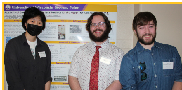
Students from all four schools presented their oral and poster presentations at the May 6, 2022 Undergraduate Research Symposium.

Leading up to the event, the college launched an effort to build on a $10,000 endowment in support of the Symposium. Through a series of Partners in Discovery emails and social media posts, we encouraged UWSP alumni and community members to help achieve our vision of giving the Symposium a deeper, lasting impact. Gifts to grow this collaborative research work make it possible for more students in the future to have more resources to make valuable discoveries. Would you like to help us in this exciting research support endeavor?