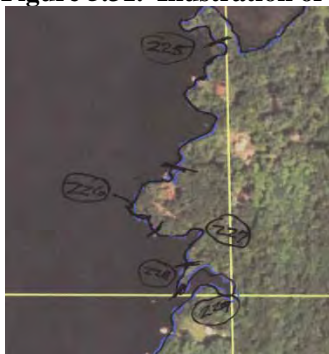
Figure 5.31. Illustration of CWS Inventory Methods

Contributors recorded observations of CWS by drawing lines parallel to the shoreline. Shorelines with differing CWS characteristics are separated by small perpendicular lines. Each line segment is recorded with a Personal Identification Number (PIN). The PIN is also recorded in a log book and the CWS status is noted.