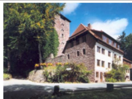
After living and participating in hands-on natural resource activities at CWES for two weeks, this 13 th century castle in Germany becomes home to CNR students for part of the summer.

Prior to departure for Europe, CNR undergraduate students attend a two-week field session at the UWSP Central Wisconsin Environmental Station on Sunset Lake, 17 miles east of Stevens Point. This part of the program is similar to, but condensed from, the Treehaven experience and includes many of the same exercises in surveying, lake and stream mapping, plant and wildlife identification, cover type mapping, data collection and scientific report writing.