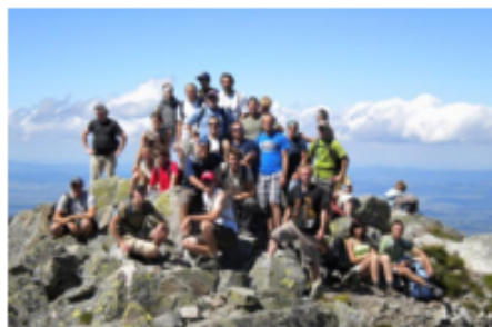
Students summit the Tatra Mts in Poland