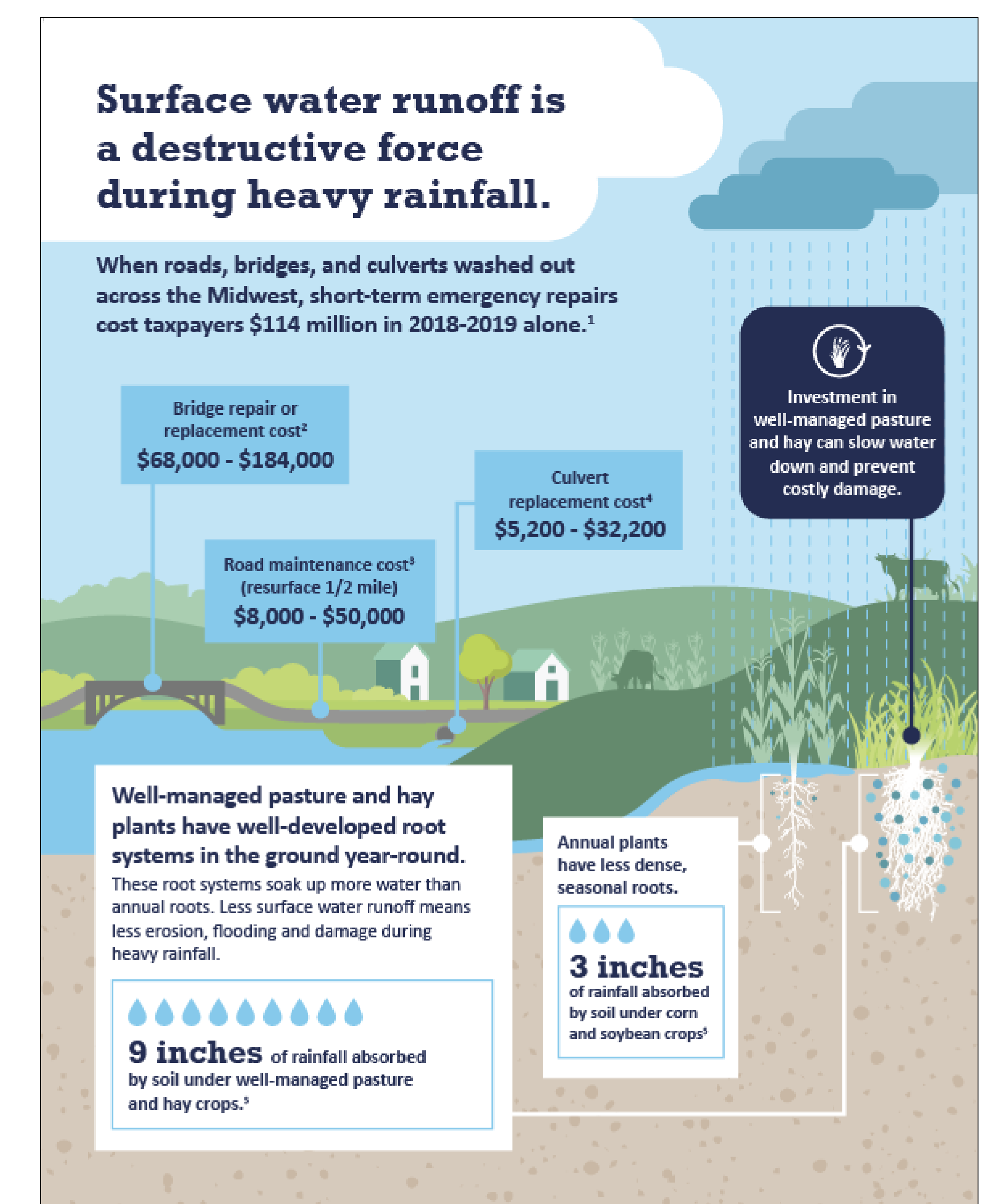
Figure 2. Created by Background Stories for Green Lands Blue Waters & Midwest Perennial Forage Working Group – benefits of soil management

The RWM is being alpha-tested through UWSP student use with local communities in mind. Their feedback will be used to revise the RWM. The process to make the RWM available through its own website is underway by UW- Madison Extension. The Extension will also be distributing the RWM through “Train the Trainer” workshops.