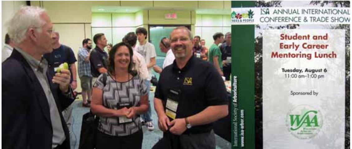
Figure 2. Students, mentors, and industry leaders assemble at the 2013 ISA Annual International Conference & Trade Show (Toronto, Ontario, Canada).

formulated in a proposal to the ISA Board of Directors who voted to plant this seed and let the idea grow.