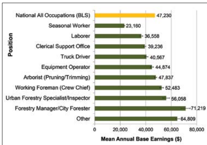
Figure 4. Mean annual base pay for various municipal government tree care positions. (BLS is the Bureau of Labor Statistics; National All Occupations includes all job in the U.S.; Other includes various self-reported jobs, such as assistant city forester, supervisor, horticulture manager, tree inspector, utility forester, and district foreman.)