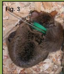
Fig. 3 (left) Adult female G. volans during anesthesia recovery period after having been fitted with radio transmitter and ear tag.

Using a hand-held antennae, exact den locations were taken three to four times weekly during G. volans periods of inactivity (1000-1600) from the time of capture through the length of transmitter battery life (40-60 days). Den trees were evaluated on the basis of tree species, dbh, tree height, and stages of decay (Maser et al. 1979). Den hole entrances were evaluated on the basis of height above the ground, entrance hole height and diameter, and direction of den entrance. Average dbh of all trees >10 cm within a 2 m radius circle were recorded, averaged, and classified as either coniferous or deciduous. Within the 2 m radius circle along 3 parallel 4 m transects placed east to west percent shrub cover <3 m was measured with line intercept transects to determine percent shrub cover (Higgins et al. 1994). Den sites were compared to 32 randomly selected sites within the study area. Trees were counted as den sites if an individual during a period of inactivity was located within the tree using radio telemetry.