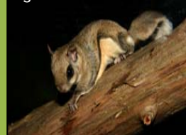
Fig. 1 (left) G. volans are grey on their dorsum and dorso-ventrally flattened tail and completely white ventrally. Total length is 21.1 to 25.7 cm, weight is 45-70 g.