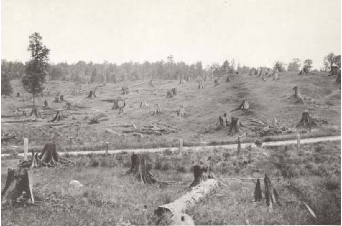
The State Historical Society of Wisconsin #WHi(W63)2976 (Image has been cropped)