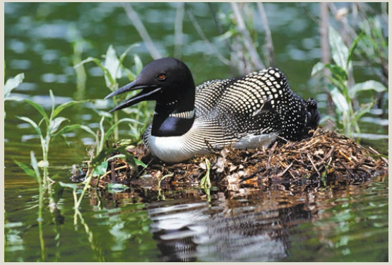
Stephen J. Lang

Shoreline habitat consists of many natural elements woven into the aquatic ecosystem to form a web of life. Native vegetation, bottom materials, and natural debris play essential roles in the life cycles of fish and wildlife. Nearshore alterations that damage or destroy these habitat components sever essential strands in the web. As a result, the ecosystem is weakened, wildlife move elsewhere, and fish numbers decline.