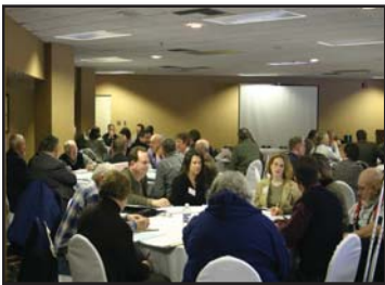
Roundtable discussions at the workshops enabled participants to network and brainstorm ideas for local implementation