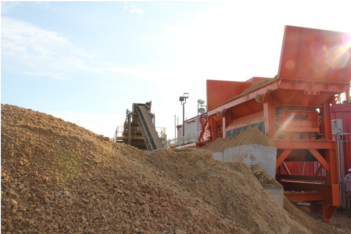
Photo 1: Marshfield: Sand Processing Facility