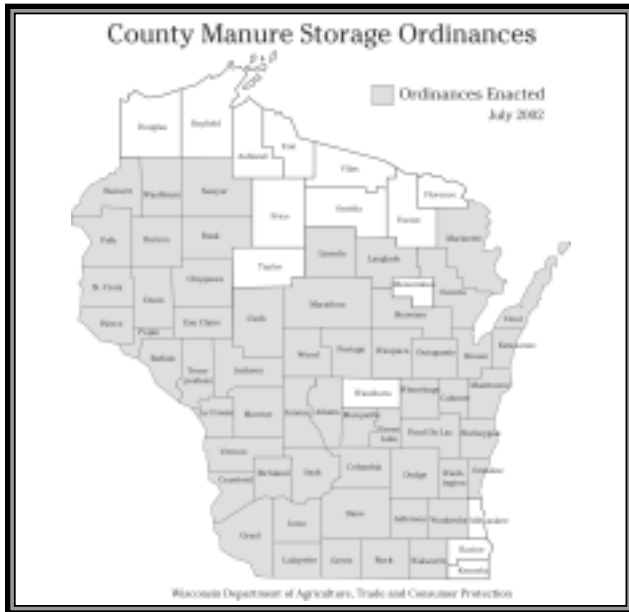
Figure 5.2: Counties with Manure Storage Ordinances in Wisconsin

Under section 92.11, Wis. Stats., counties, cities, villages, and towns may enact ordinances that prohibit land uses and management practices responsible for excessive soil erosion, sedimentation, nonpoint source water pollution or stormwater runoff. Under this broad authority, local governments may regulate most types of farm practices (related or unrelated to livestock production) to protect water quality. Ordinances under this section do not become law unless approved by a referendum. In 1998, the towns in Manitowoc County voted to approve an ordinance under this authority to regulate manure applications and livestock grazing near waterways.