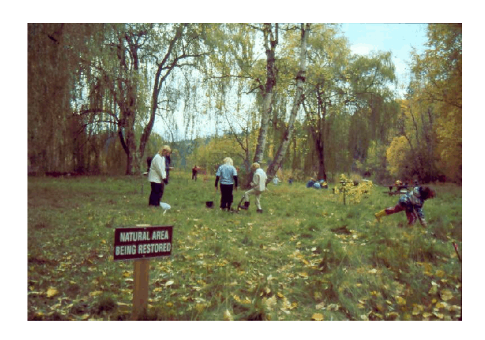
Special Interim Update