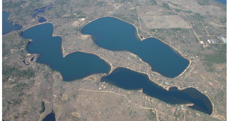
Long and Des Moines Lakes, Burnett County, Wisconsin

Over the years, more and more of us are living and building along lakes. One lot at a time, we are changing the natural features of shoreland areas to accommodate our landscaping and recreational preferences.