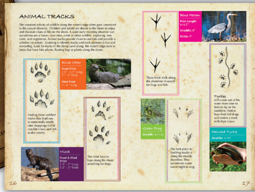
Youth Field Guide

grandchildren. One additional component of our communication materials is the "Share Your Shore" logo and color scheme we developed to brand the campaign and provide visual unity across the various campaign materials.