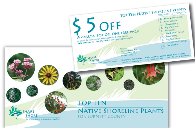
Top Ten Native Plants brochure and coupon