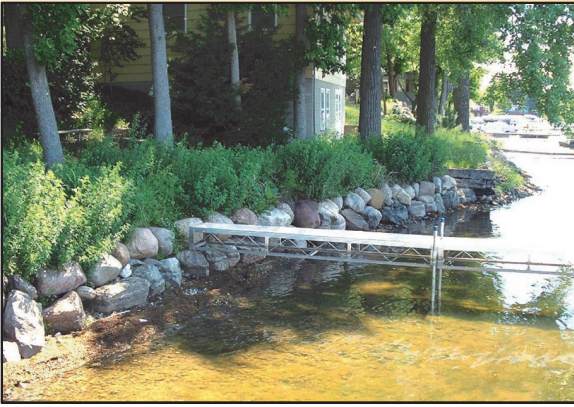
Shrubby vegetation planted above a rock toe prevents erosion better than grass or a lawn especially in circumstances of flooding and intense wave or ice action.