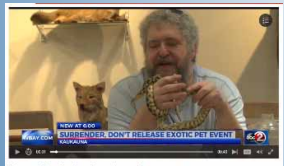
'Surrender, don't release' exotic pet event