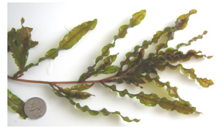
Curly-leaf pondweed has alternate, wavy leaves with blunt tips.

Description: Curly-leaf pondweed is a non-native, perennial aquatic plant in the Potamogetonaceae family, can grow in very shallow water or down to at least 15 feet deep. Its leaves are alternate with serrated margins, a blunt tip, and 3-5 veins running from the base to the tip. Late in its seasonal life cycle, the leaves become very wavy, but young plants have flat leaves. Curly-leaf pondweed typically dies back in June/July, but may grow year-round if a source of cool water exists nearby. Small, cloning buds (turions) are produced at the tip of the plant and in the leaf axils, which lie dormant through the summer and sprout by the following spring.