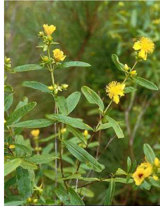
Shrubby St. Johnswort Hypericum prolificum 3' High, Blooms June-August