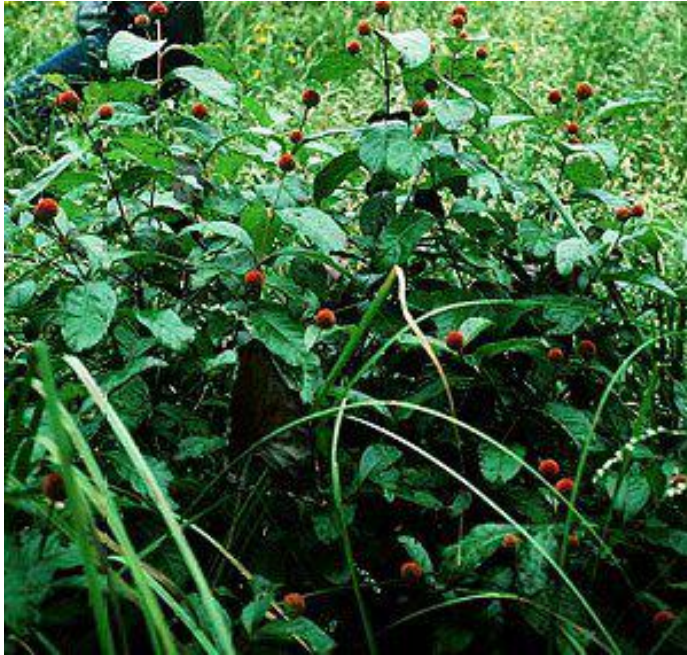
Buttonbush Cephalanthus occidentalis 6-12' High, Blooms July-Aug