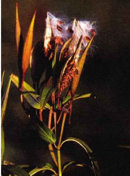
Swamp milkweed Asclepias incarnata 2-4' High, Blooms July-Aug