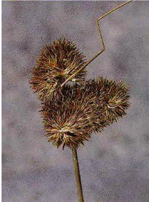
Torrey's Rush Juncus torreyi 1-3' High, Blooms June-July