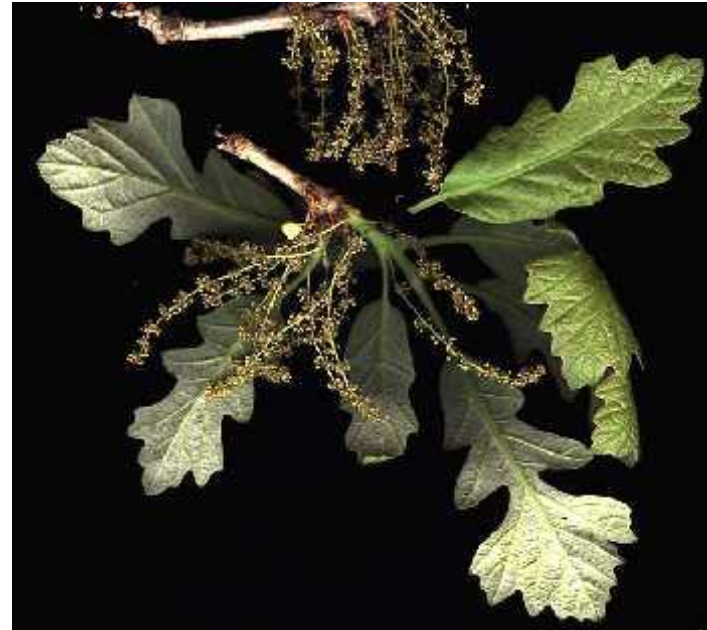
Burr oak Quercus macrocarpa 75-100' High, Fruit Sept-Oct