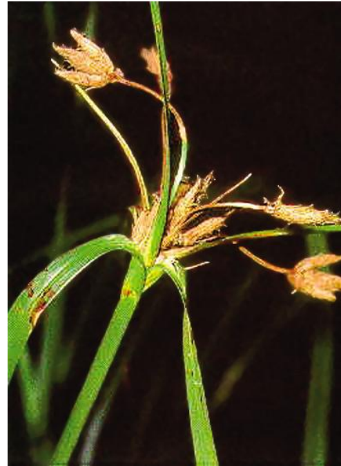
River bulrush Scirpus fluviatilis 3-5' High, Blooms June-Aug