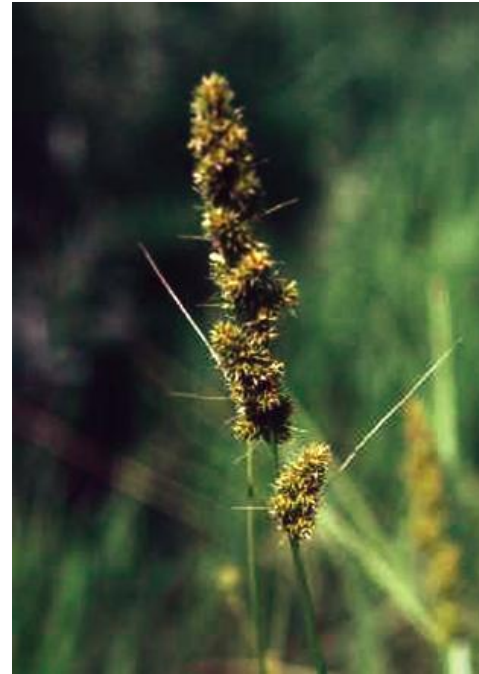
Fox sedge Carex vulpinoidea 1-3' High, Blooms June-Aug