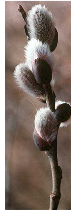
Pussy Willow Salix discolor 6-20' High, Blooms April-May