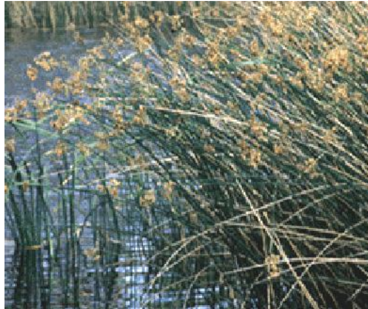
Soft-stemmed bulrush Scirpus validus 3-9' High, Blooms May-July