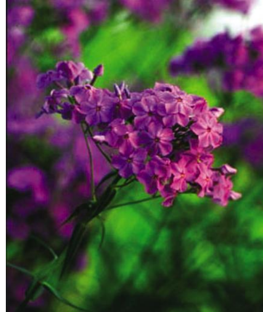
Marsh phlox Phlox glaberrima 2-4' High, Blooms June-July