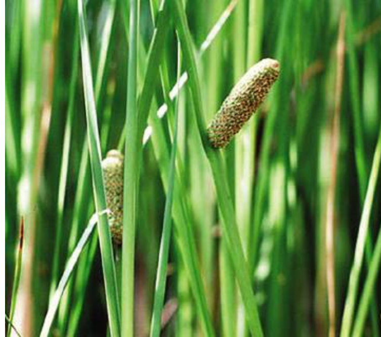
Sweet flag Acorus calamus 1-3' High, Blooms May-June