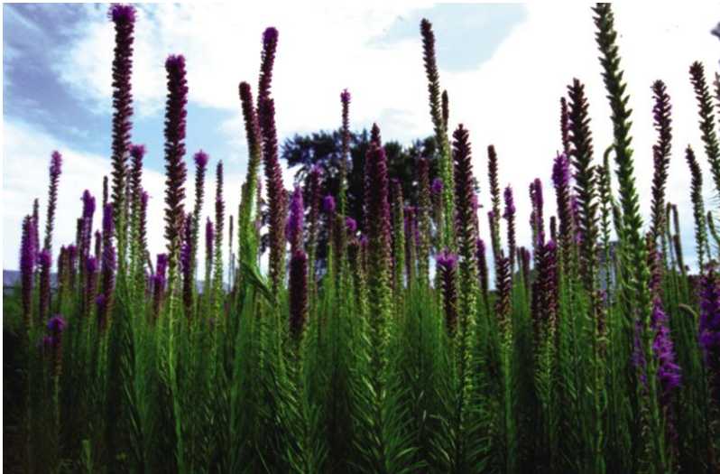
Prairie blazing star Liatris pycnostachya 2-4' High, Blooms July-Sept