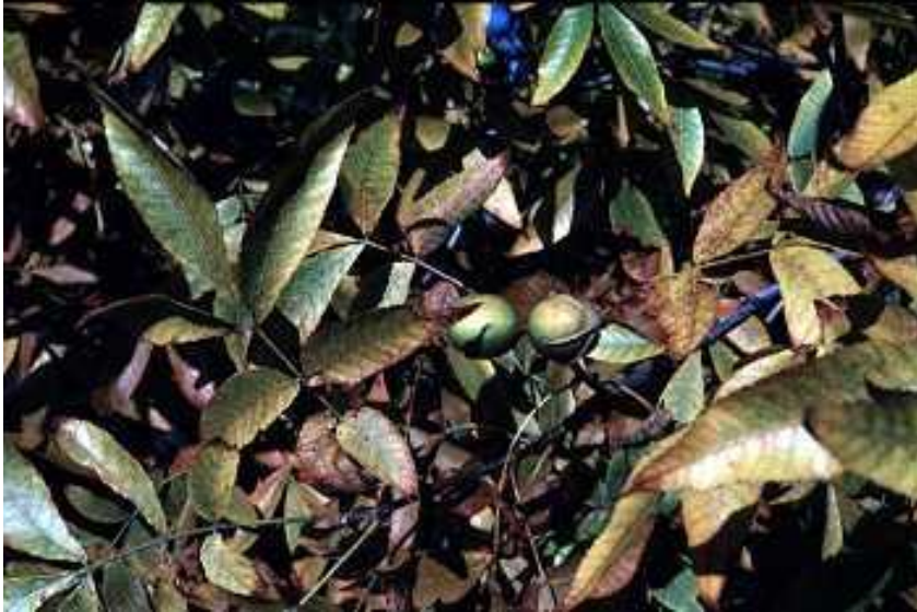
Bitternut Hickory Carya cordiformis 50-75' High, Blooms Aug-Oct