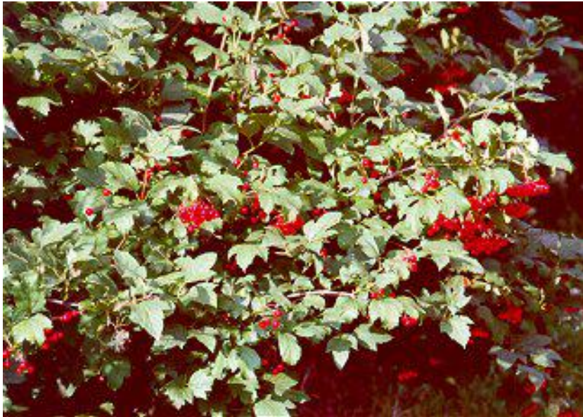
American Cranberrybush Viburnum trilobum 6-12' High, Blooms May-June