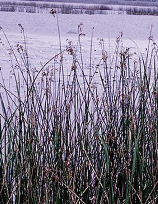
Green bulrush Scirpus atrovirens 2-4' High, Blooms May-July