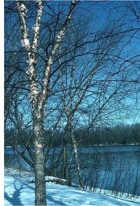
River Birch Betula nigra 40-70' High, Fruit Aug-Oct