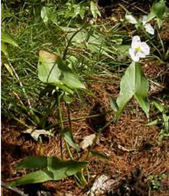
Arrowhead Sagittaria latifolia 1-3' High, Blooms July-Sept