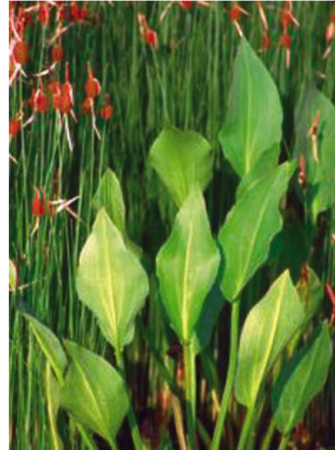
Water plantain Alisma subcordatum 1-3' High, Blooms June-Sept