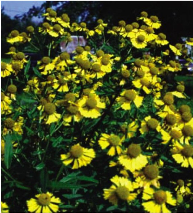
Sneezeweed Helenium autumnale 2-4' High, Blooms Aug-Oct