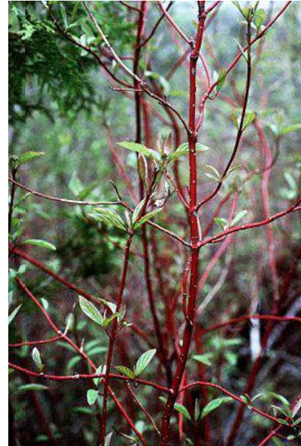
Silky Dogwood Cornus obliqua 8-12' High, Blooms May-July