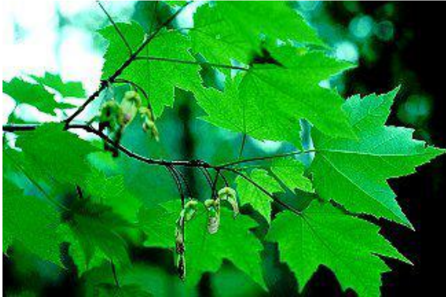
Red maple Acer rubrum 50-75' High, Blooms March