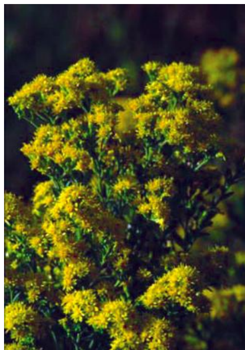
Stiff goldenrod Solidago rigida 1-4' High, Blooms July-Oct