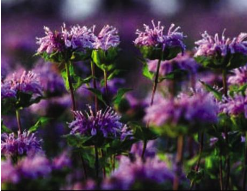
Wild bergamot Monarda fistulosa 2-4' High, Blooms July-Aug