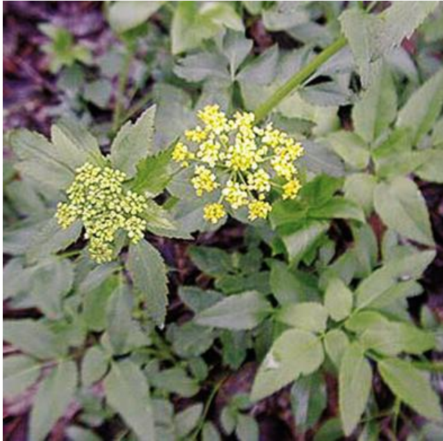
Golden Alexander Zizia aurea 1-2' High, Blooms May-June