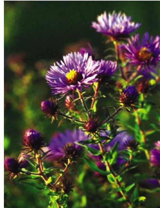
New England Aster Aster novae-angliae 1-4' High, Blooms Aug-Oct