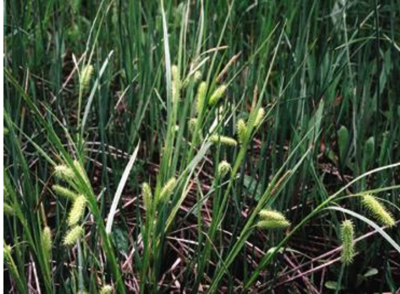
Bottlebrush sedge Carex hystericina 1-3' High, Blooms May-July