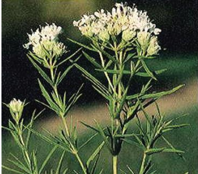
Mountain mint Pycnanthemum virginianum 1-4' High, Blooms July-Sept