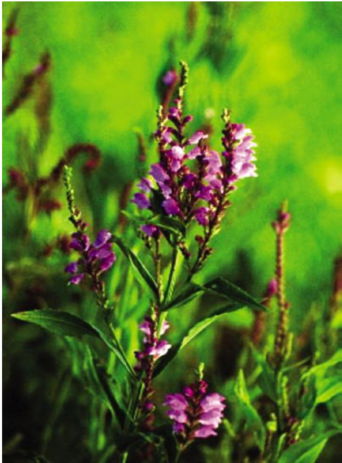
False Dragon's Head Physostegia virginiana 1-4' High, Blooms July-Sept