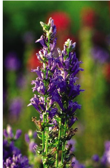
Great blue lobelia Lobelia siphilitica 1-4' High, Blooms Aug-Sept