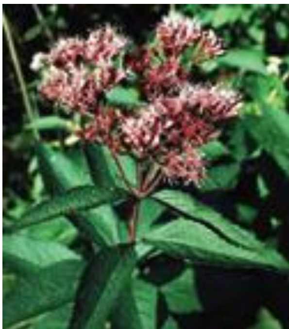
Spotted Joe-pye weed Eupatorium maculatum 2-5' High, Blooms July-Sept