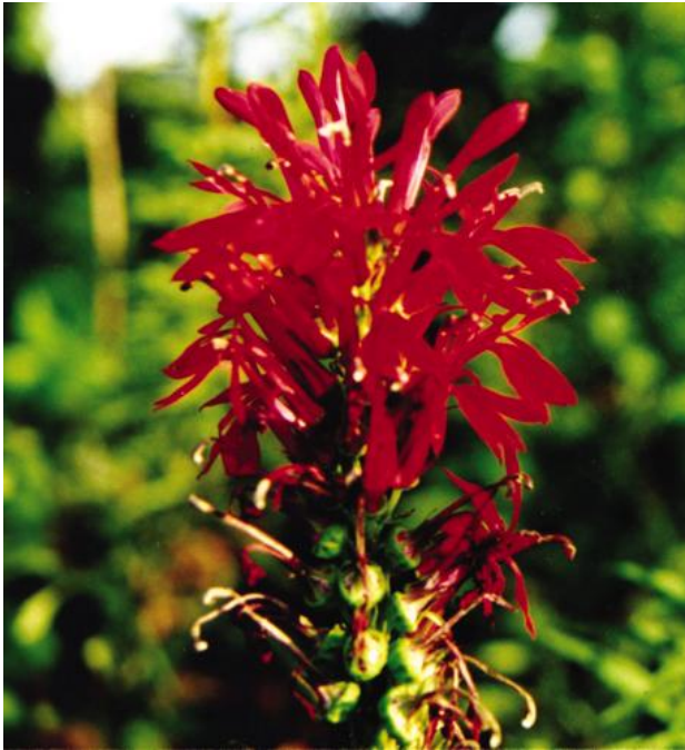
Cardinal flower Lobelia cardinalis 2-4' High, Blooms July-Sept