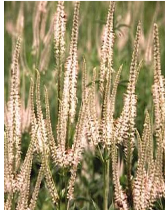
Culver's Root Veronicastrum virginicum 3-5' High, Blooms July-Aug