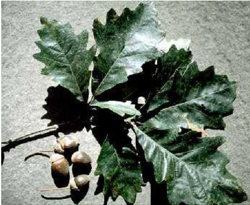
Swamp white oak Quercus bicolor 75-100' High, Fruit Sept-Oct