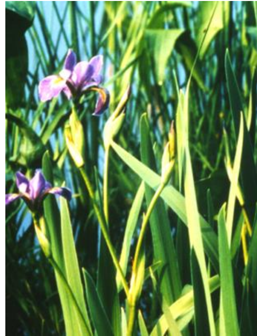
Wild blue flag iris Iris virginica shrevei 1-3' High, Blooms May-July