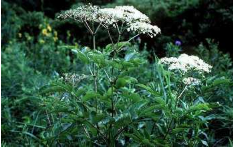
Elderberry Sambucus canadensis 6-12' High, Blooms June-July