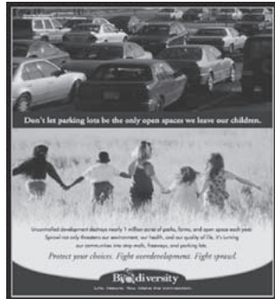
A Biodiversity Project message that connects biodiversity to the basic value of protecting our children and their future.

http://arjournals.annualreviews.org/doi/abs/10.1146/annurev.energy.30.050504.144444?cookieSet=1&journalCode=energy