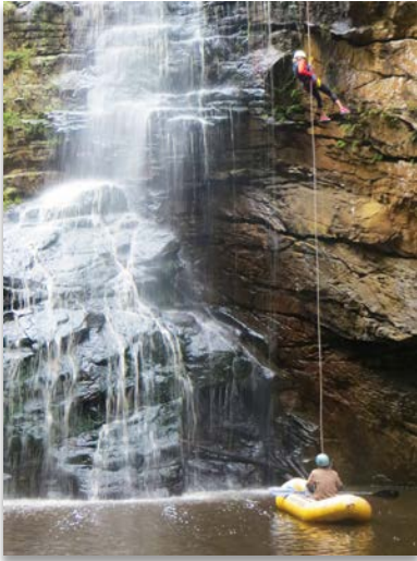
Kloofing in Wilderness