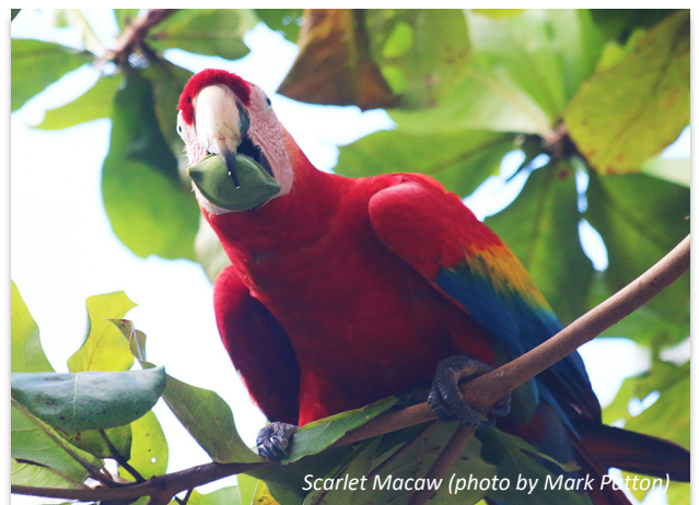
Scarlet Macaw