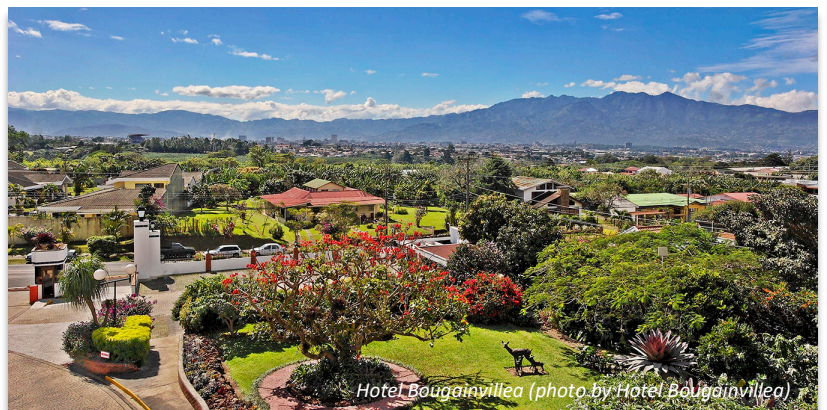
Hotel Bougainvillea