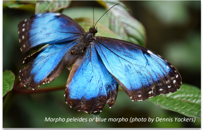
Morpho peleides or blue morpho