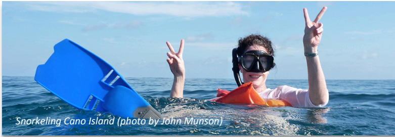
Snorkeling Cano Island