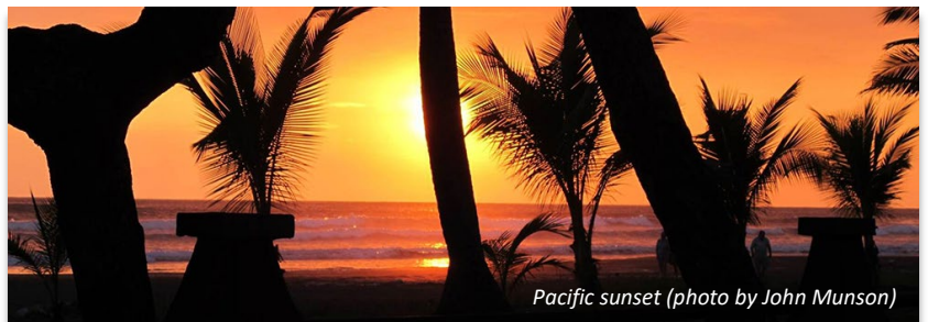
Pacific sunset