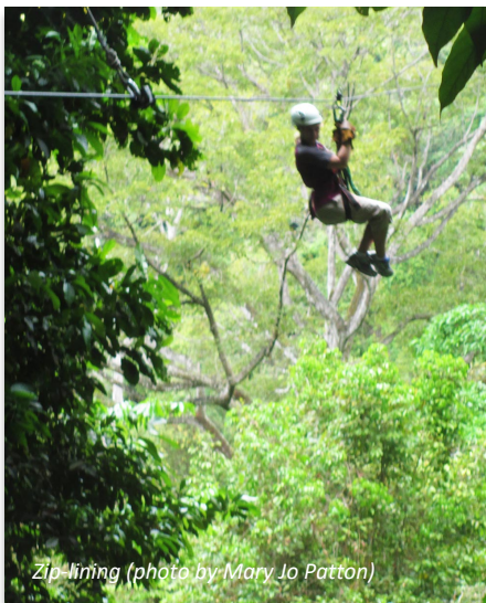
Zip-lining