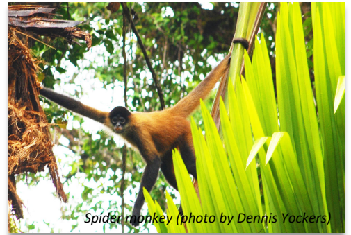
Spider monkey