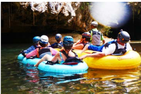
Cave Tubing