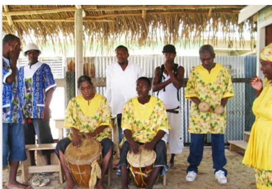
Garifuna drummers and dancers (Sue Kissinger)

back of the cave where we'll encounter Mayan pottery and Mayan skeletal remains from human sacrifices. An alternative canoe trip will be available for those not physically able to explore ATM. These participants can canoe into the Barton Creek Cave system and also view Mayan pottery and skeletal remains. Overnight at the Crystal Paradise Resort