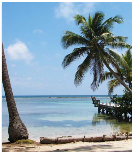
South Water Caye

Depart South Water Caye early in the morning and transfer to Dangriga. The bus will be waiting to transport us back to the Belize International Airport so we can depart for home.