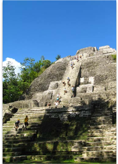
The High Temple of Lamanai