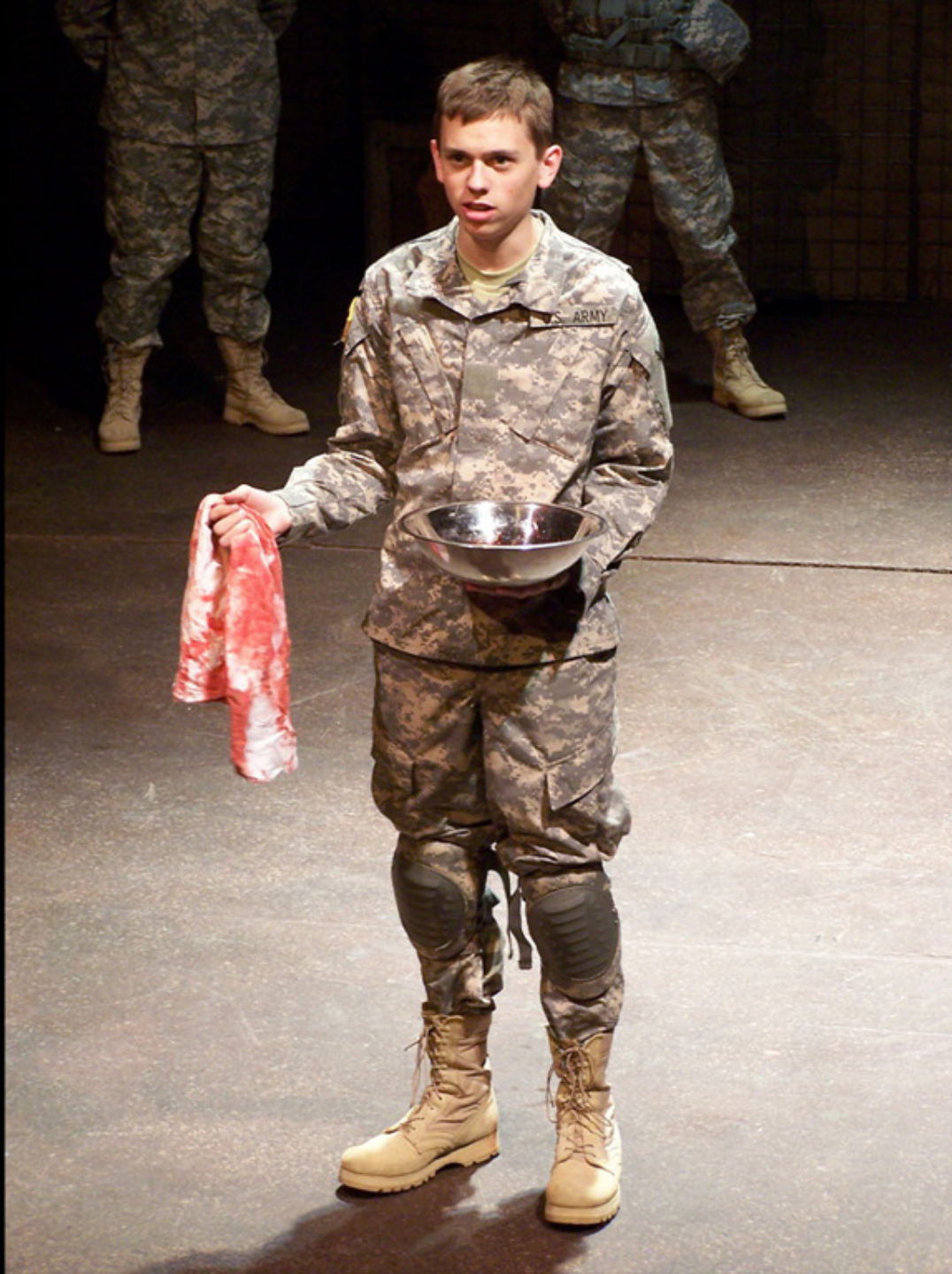
Libation of Blood