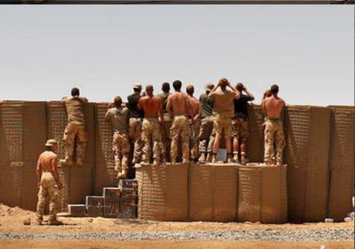
Arguing the Rules of Engagement