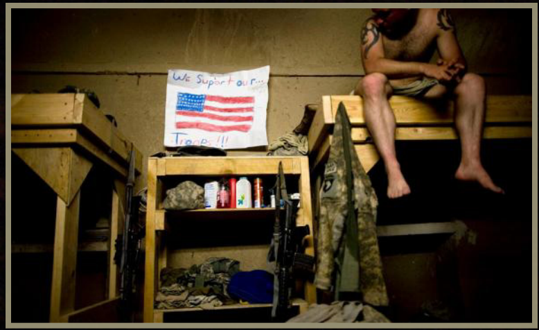
Telling the Story