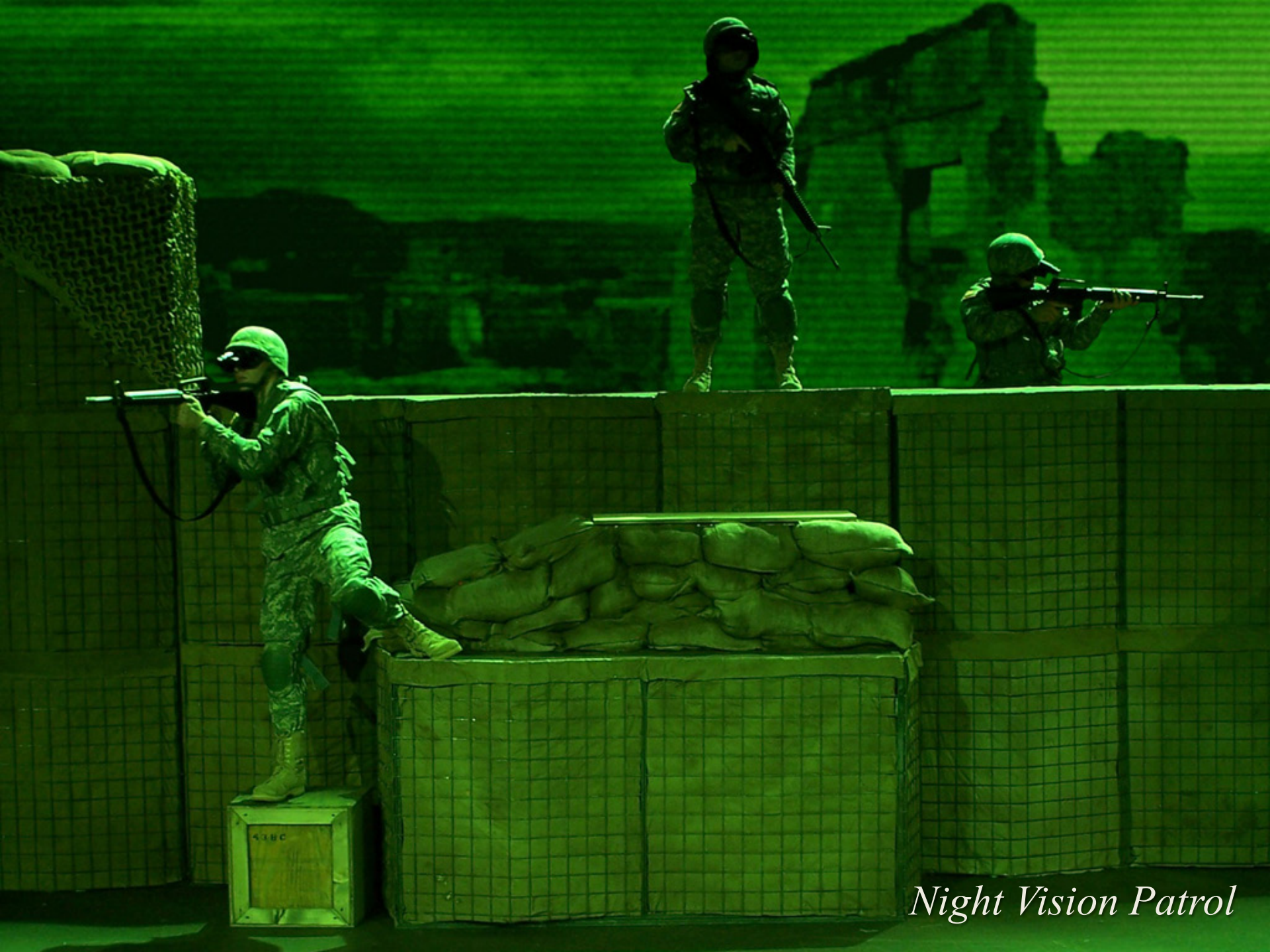
Night Vision Patrol