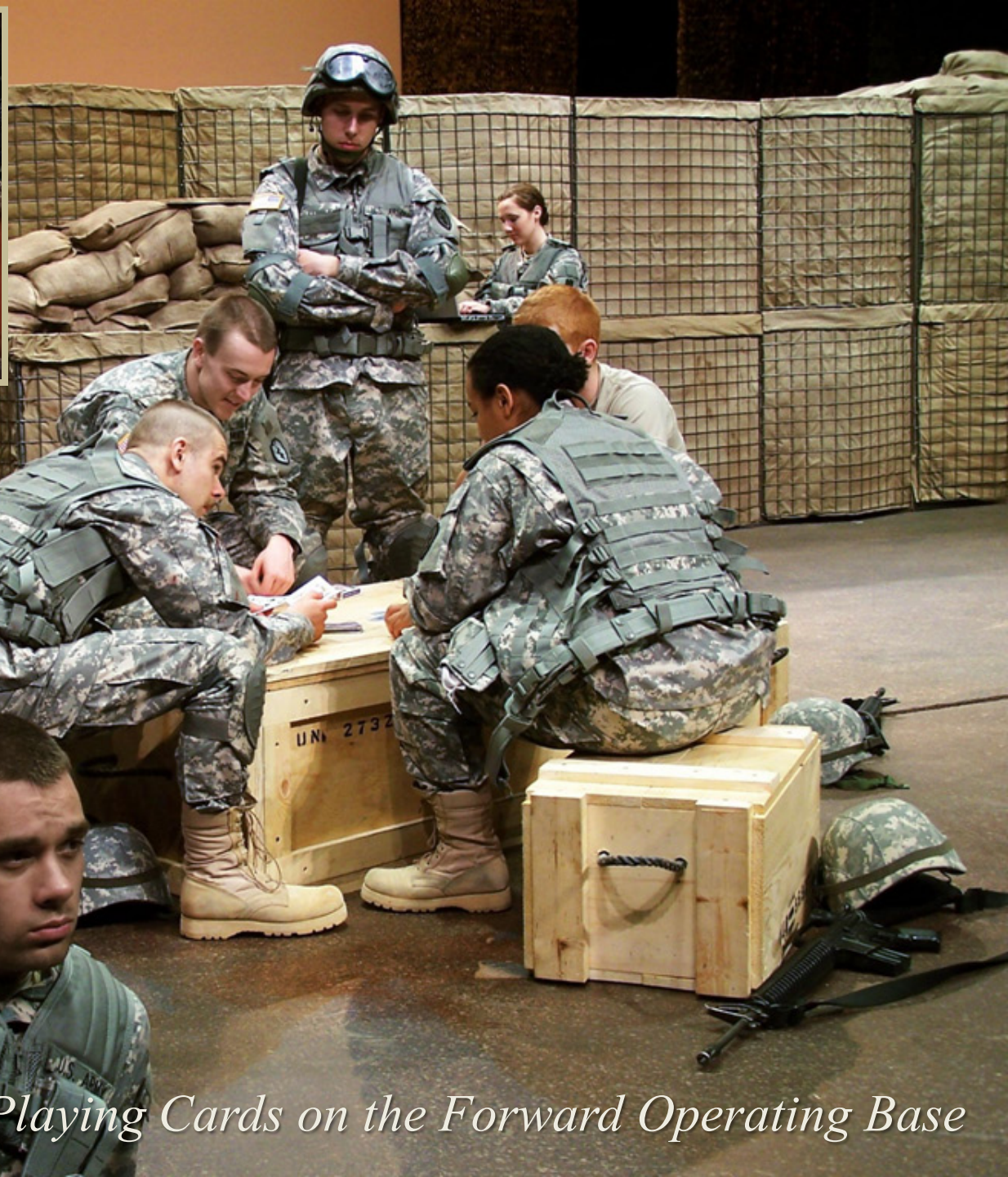
Playing Cards on the Forward Operating Base