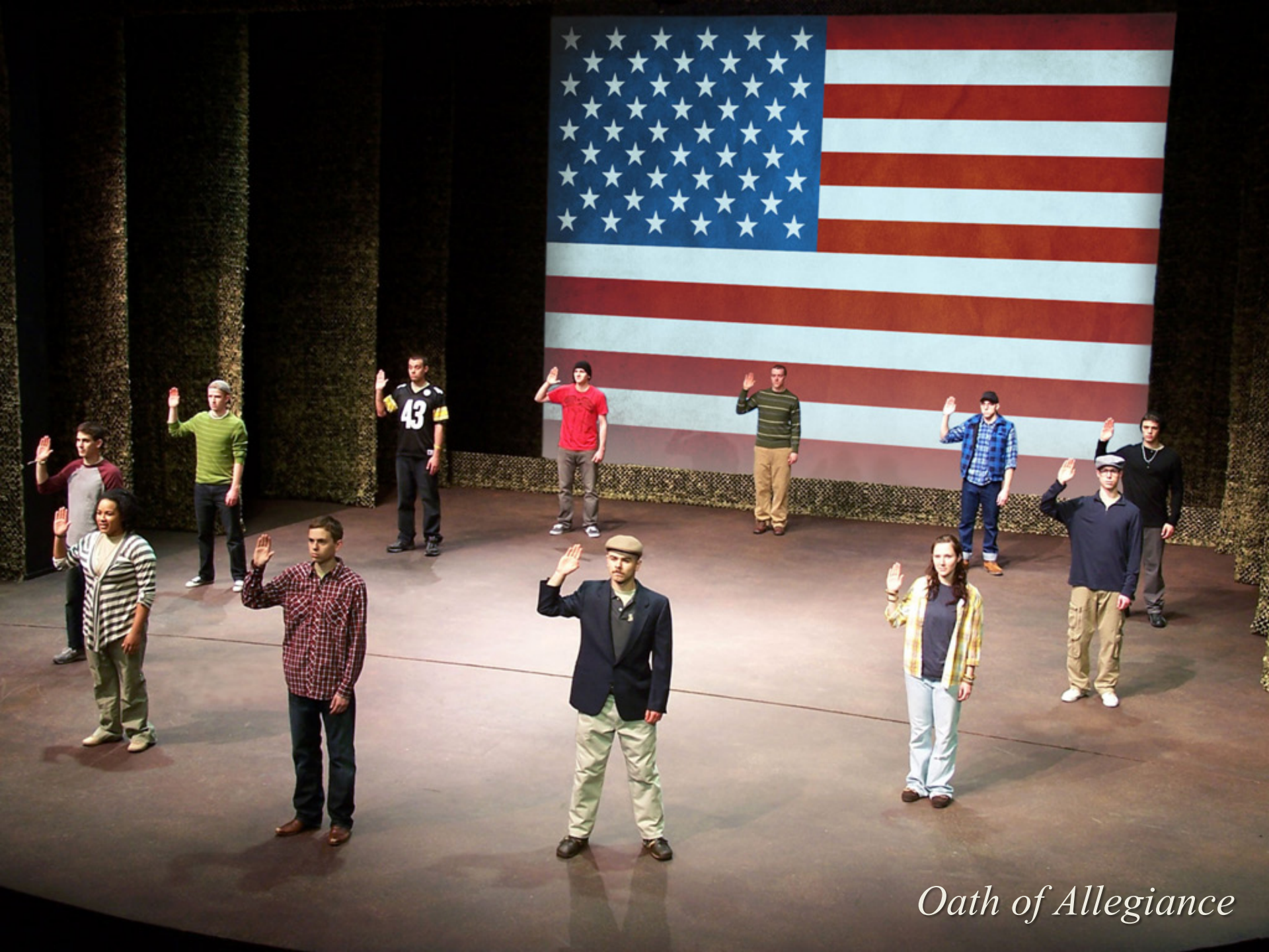
Oath of Allegiance