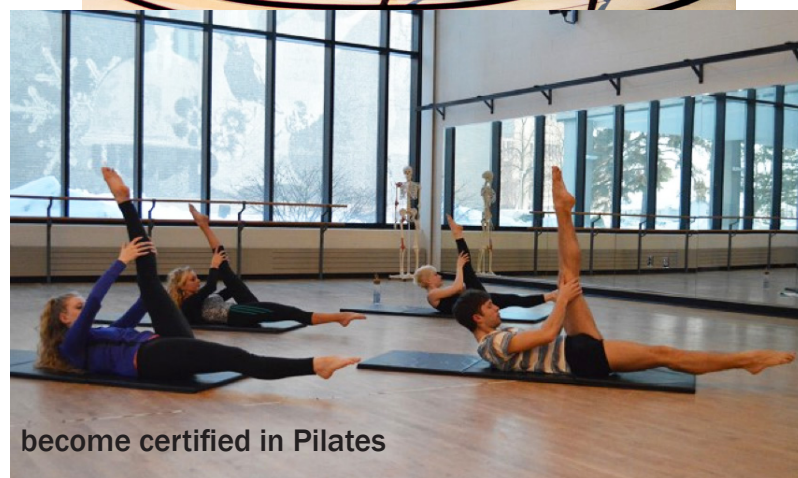
become certified in Pilates