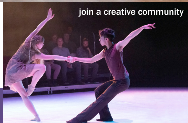
join a creative community

Join us for a world-class education in dance