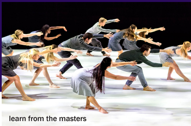
learn from the masters

UW-Stevens Point offers you the opportunity to develop your artistry in beautiful dance studios and performance spaces. Our program features a wide-range of stylistic offerings, live accompaniment, and renowned faculty who guide you in discovering your creative potential and reaching your goals.