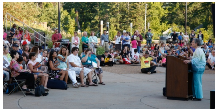
ASI 2012 Welcome Ceremony

To reserve a spot, contact Outdoor EdVentures here at UWSP. Phone 715-346-3848 or email outedven@uwsp.edu .