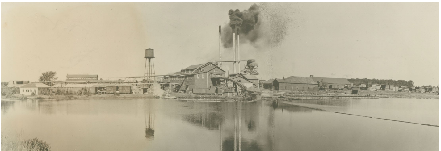
This photograph from the Sara Connor Papers shows the Roddis Corporation's sawmill in Park Falls, Wisconsin. Once processed, the collection will be available for research use in the Archives.

The history of forestry and the forest products industry have long been collection strengths for the UWSP Archives. Adding the Sara Connor Papers to the Archives' collection will continue to highlight the Archives as the primary destination for researchers studying the history of the lumber industry in North Central Wisconsin.