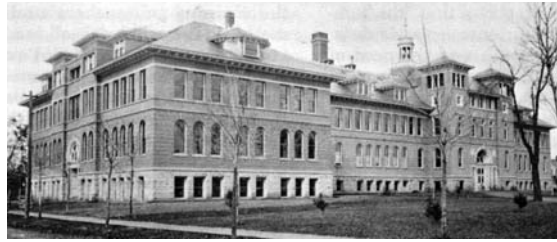
Old Main with the West Wing Addition

As the need for more space increased, the east wing was built in 1914; the same year construction began on Nelson Hall. The total cost was $76,000 and it was an almost exact replica of the west wing. The wing had finished oak woodwork, high wainscoting and beamed ceilings, and housed the relocated Home Economics Department. That was not the end of the remodeling, though. In 1917 the basement was remodeled. The library facilities were improved in 1924 and 1930. New heating and lighting were added in 1954. The gymnasium was moved to the Communication Arts Building and the vacated space was converted into classrooms.