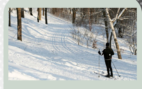
The trails of Standing Rocks County Park, located in Eastern Portage County

To help contribute to the Stevens Point community, check out: <u>https://www.volunteersrock.org</u> for different volunteer opportunities in Portage County. The community also offers numerous opportunities to engage in social activities even during the cold winter months. You and your friends can try some cross country skiing through Standing Rocks County Park. Or, bring your family to the hills of Iverson Park for some sledding, snowboarding, and tobogganing. Also, Iverson and Goerke Park have amazing outdoor skating rinks! The parks are typically open from the second week of December through the end of February, so come on out and enjoy the great winter activities Stevens Point has to offer!