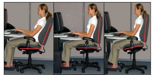
The middle picture best illustrates a proper working position.

ture for too long. Make sure to frequently change your working position throughout your day. You can make small adjustments to your chair or backrest as well as stretching your fingers, hands, arms, and torso. You could also stand up and walk around for a few minutes to bring proper blood flow back to your legs and feet. Also, see if stand-sit workstations are available for you!