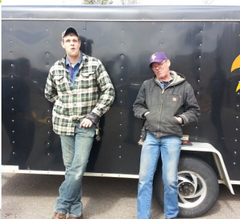
Project Crew, enjoying the day.

Thank you to everyone that attended or brought a dish to pass, donated and helped to make this a enjoyable day for everyone. T.E.A.M. (Together Everyone Achieves More)