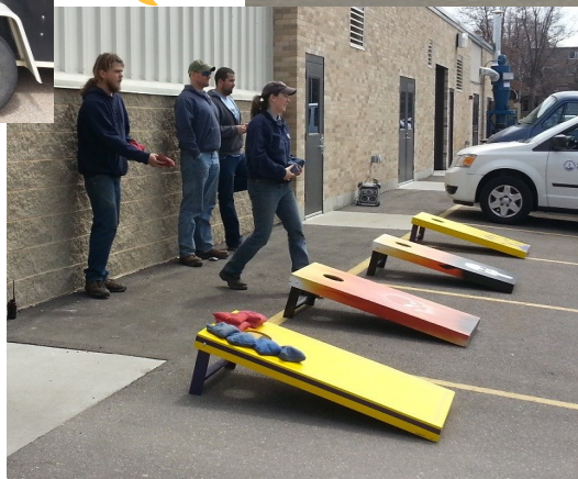
Grounds Crew, teaming up for bag toss.