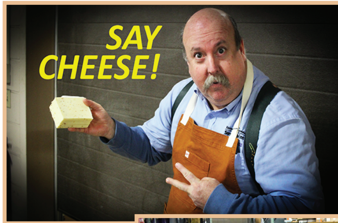
CHILI & SOUP FEED JANUARY 18, 2023

A: It takes too long to put their cleats on.