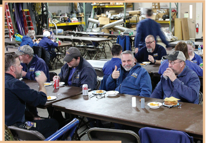
CHILI & SOUP FEED JANUARY 18, 2023