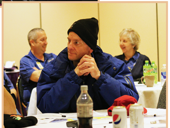
ANNUAL WINTER MEETING & TRAINING EVENT JANUARY 11, 2023