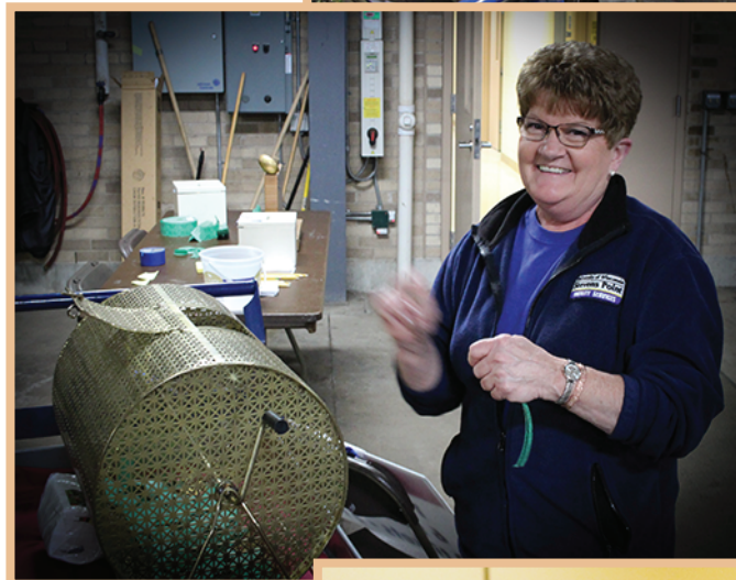
CHILI & SOUP FEED JANUARY 18, 2023