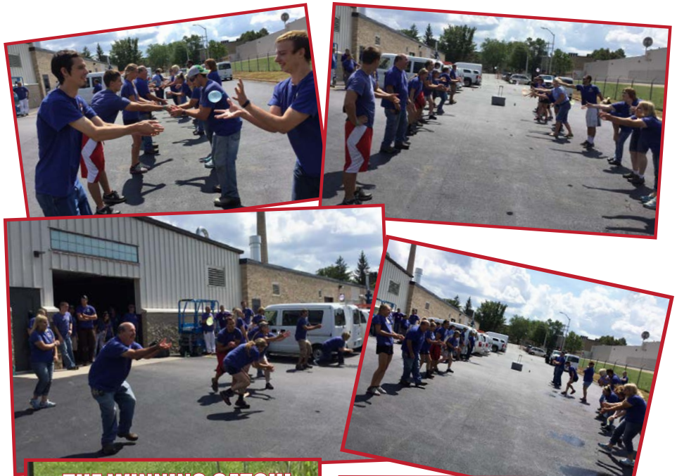
THE WINNING CATCH!

The Detroit Lions play the Indianapolis Colts in Indiana later that same day.