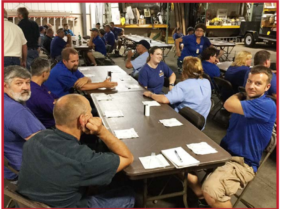
On Friday, August 19th, members of UWSP Facility Services enjoyed some time together during the annual Summer Meeting at the M&M Building.