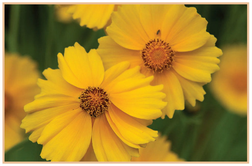
These "May" flowers courtesy of the UWSP Facility Services Grounds Work Unit.

We appreciate everyone that participated in this year's guessing game... Your participation helps to ensure that great T.E.A.M. sponsored events will continue. Thank you!