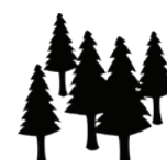
The Mysterious Forest