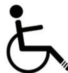
The Missing Patient