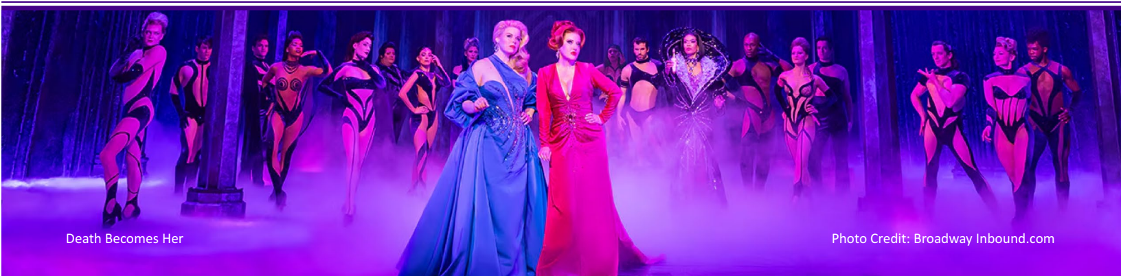
Death Becomes Her