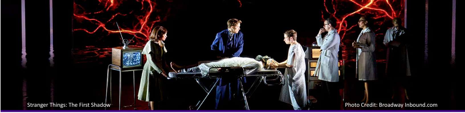
Stranger Things: The First Shadow