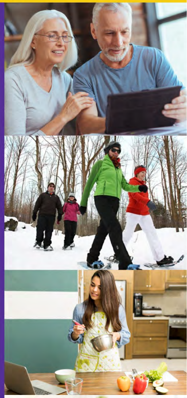
Table to Contents

Youth: p. 3-6 Fine Arts: p. 8 Travel: p. 9