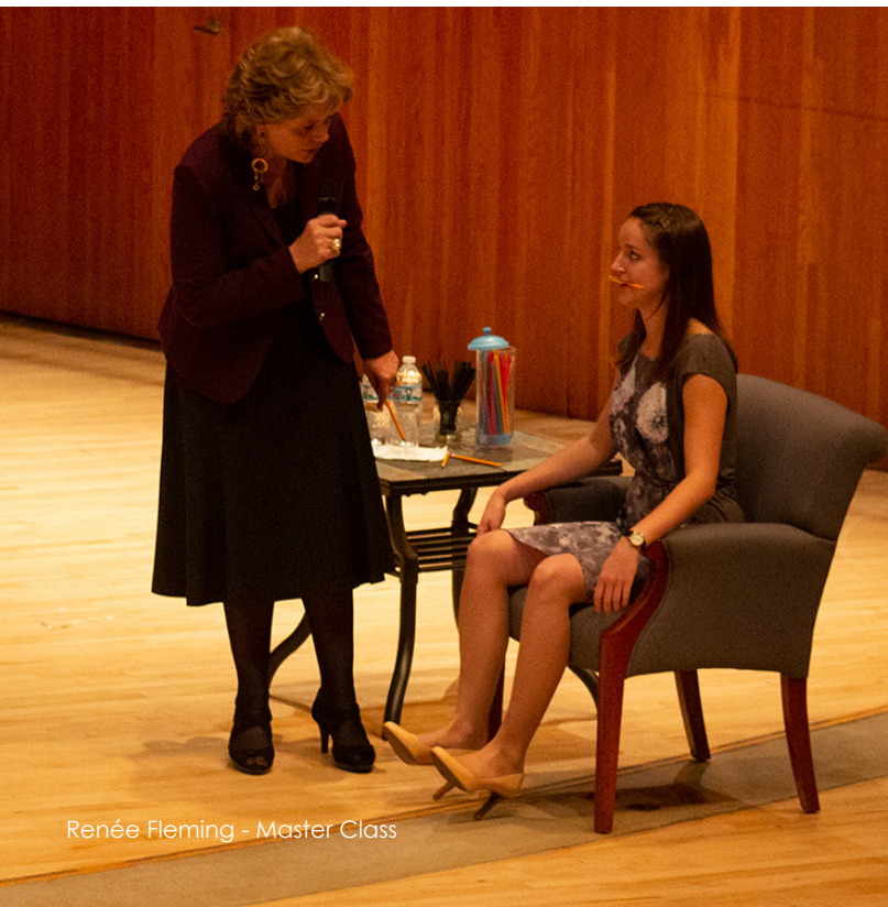
Renée Fleming - Master Class