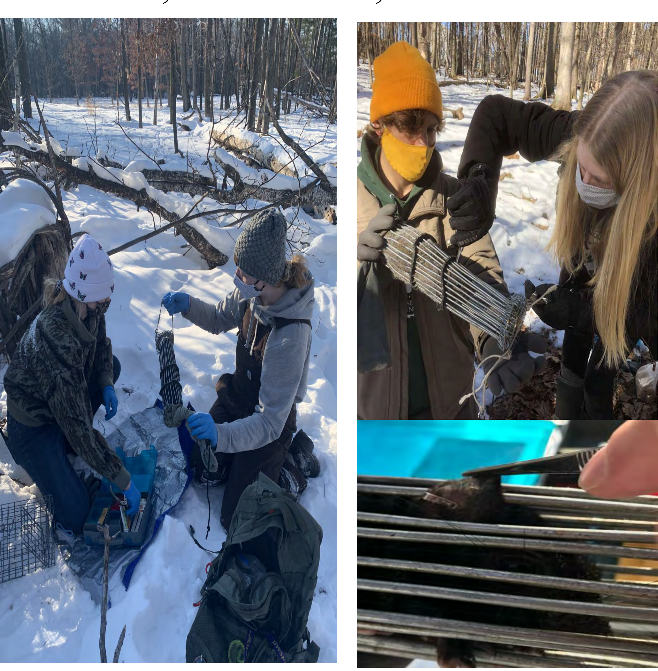
Figure 3: Age is determined by spreading fur on the hind leg to count buffy colored rings.