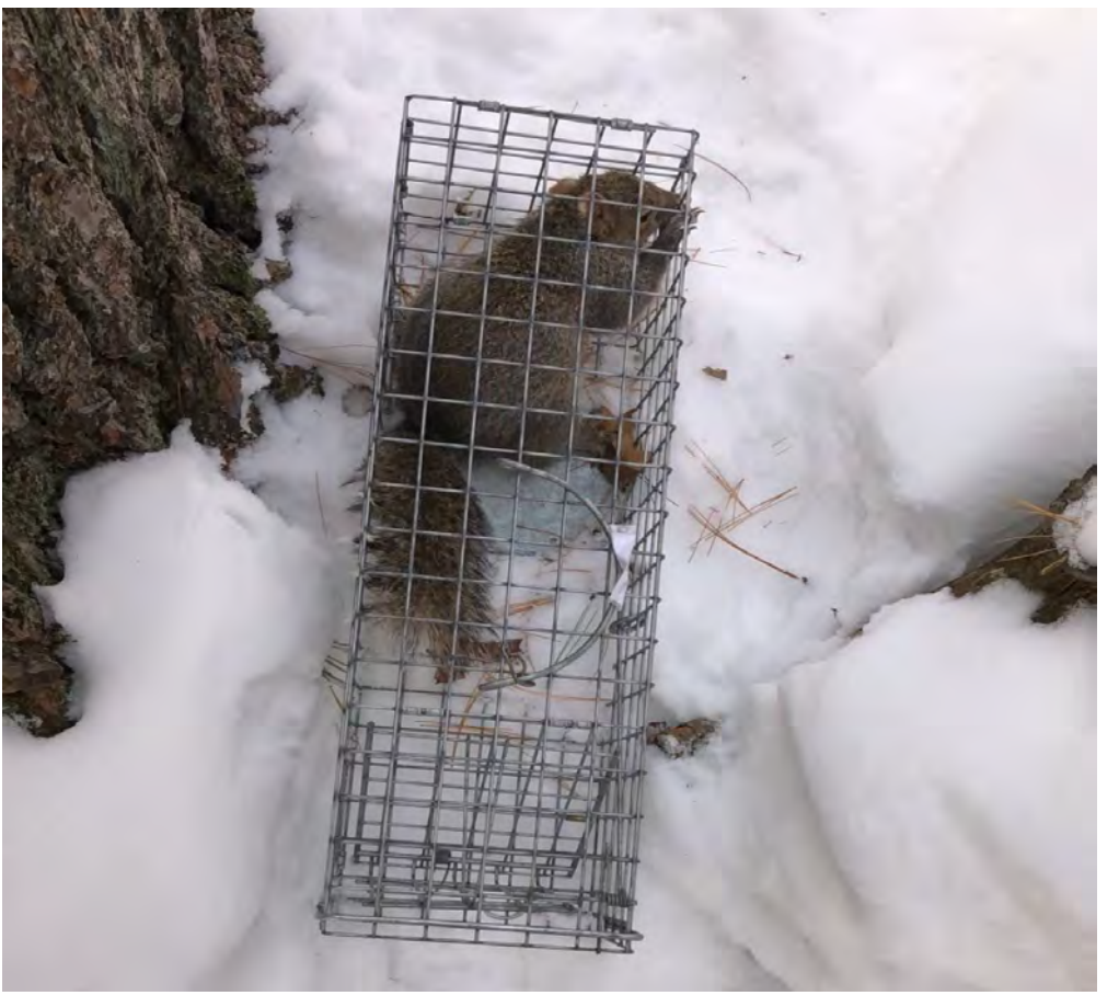
Figure 2: An eastern gray squirrel in a Tomahawk live trap.

Figure 1: A set and baited Tomahawk live trap.