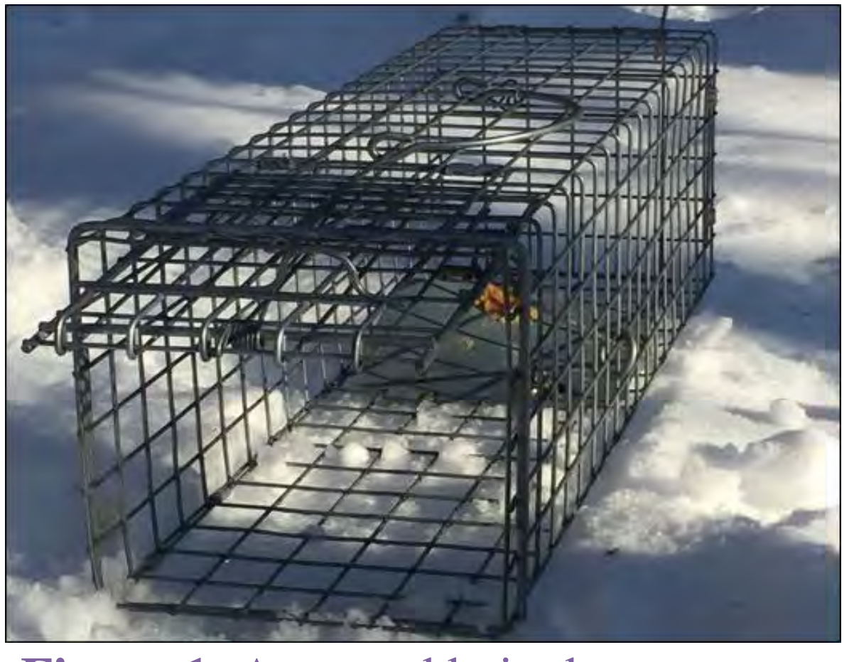
Figure 1: A set and baited Tomahawk live trap.