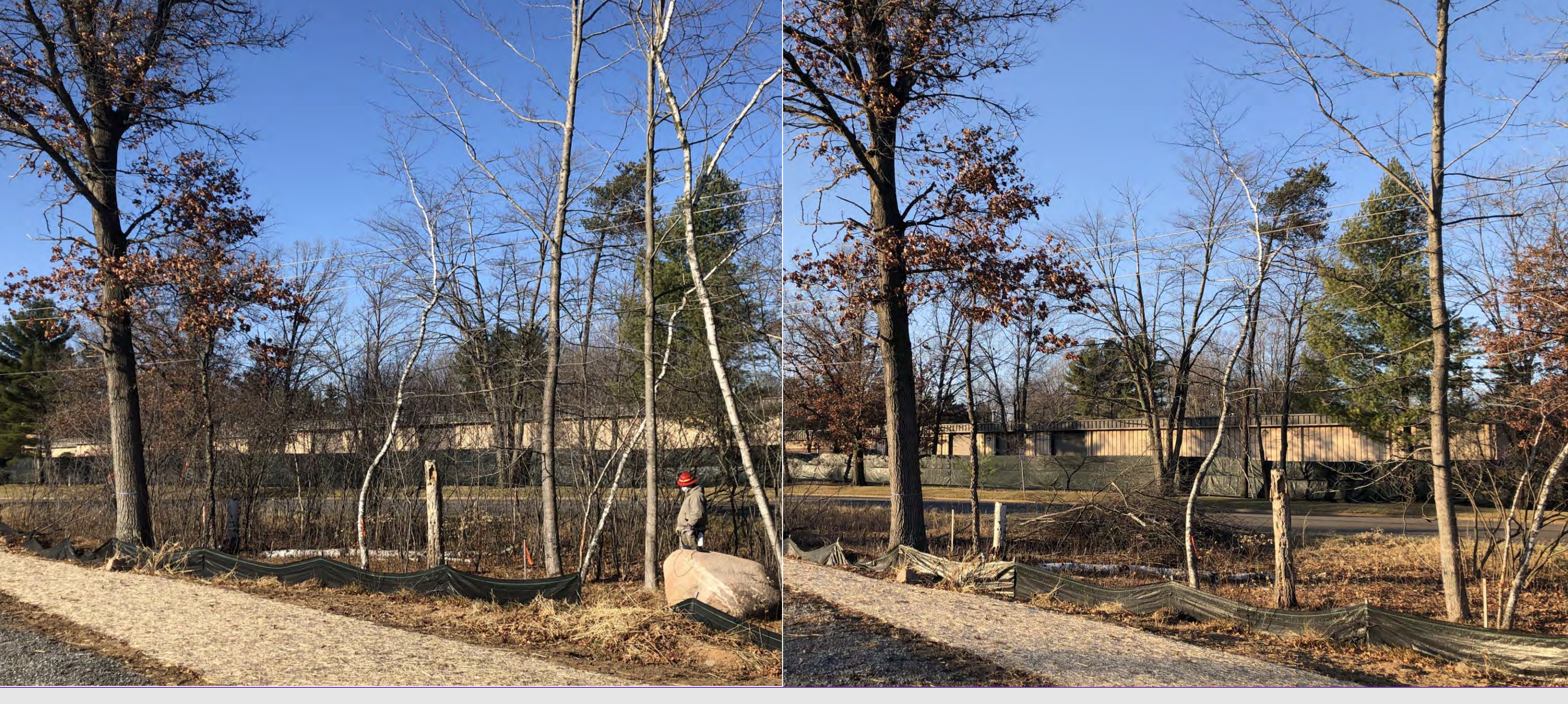
Figure 2. The north quadrant of the site before removal of glossy buckthorn (left) and after removal (right).