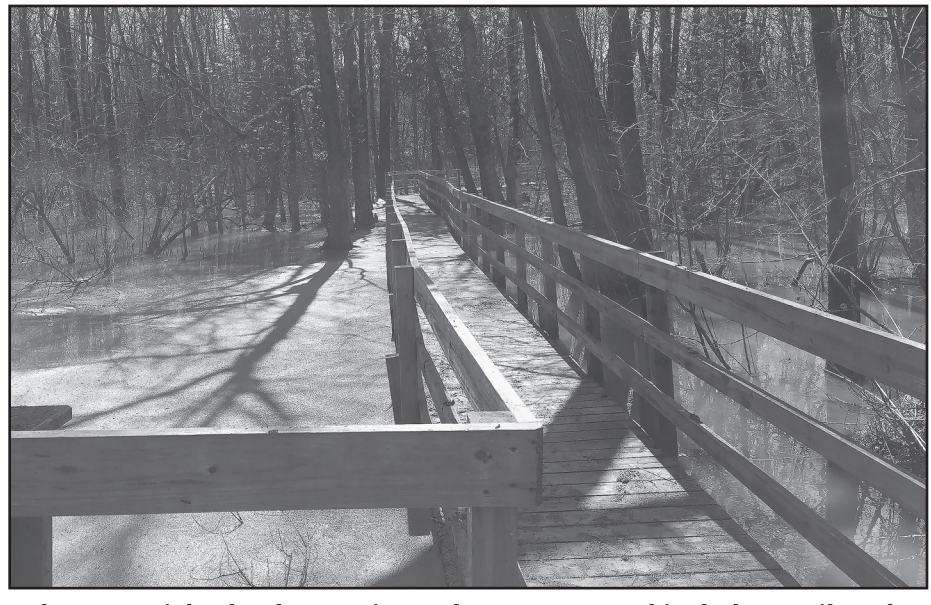
Rahr Memorial School Forest is nearly 300-acres and includes 5 miles of well-marked trails and a 1,500-foot boardwalk through a swamp.

Access: Head to the lake on County Road V east of Highway 42. At the school forest sign, turn north on Sandy Bay Road and park along the road by the gate. The no trespassing sign